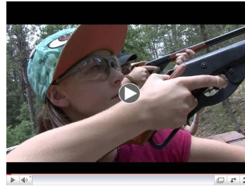
Junior High Camp 2013

http://livingwordonline.com/index.php/summer-camp