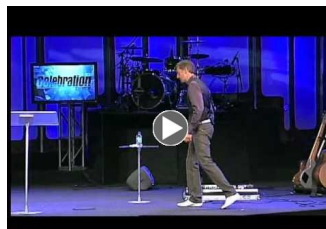
Link to video lesson here