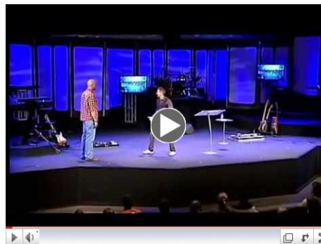
The Bait of Satan

The video clip we watched in class is included below.