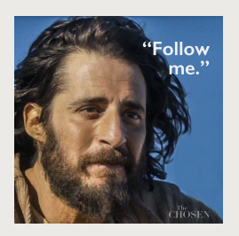
Sundays at 9:30am The Chosen Season 2