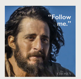
Sundays at 9:30am The Chosen Season 2

July 9, 2022 Episode 8 - Beyond Mountains Part 1