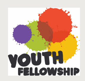
Paused for the Summer Every Wednesday at 7pm

Questions answered about The Chosen by the director