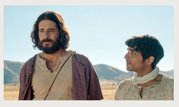
Beyond Mountains This past Sunday, we started Episode 8 from Season 2 of