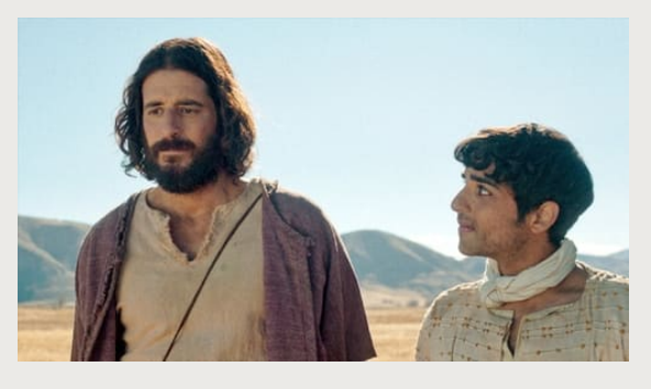
Beyond Mountains Last Sunday, we finished the last Episode from Season 2 of